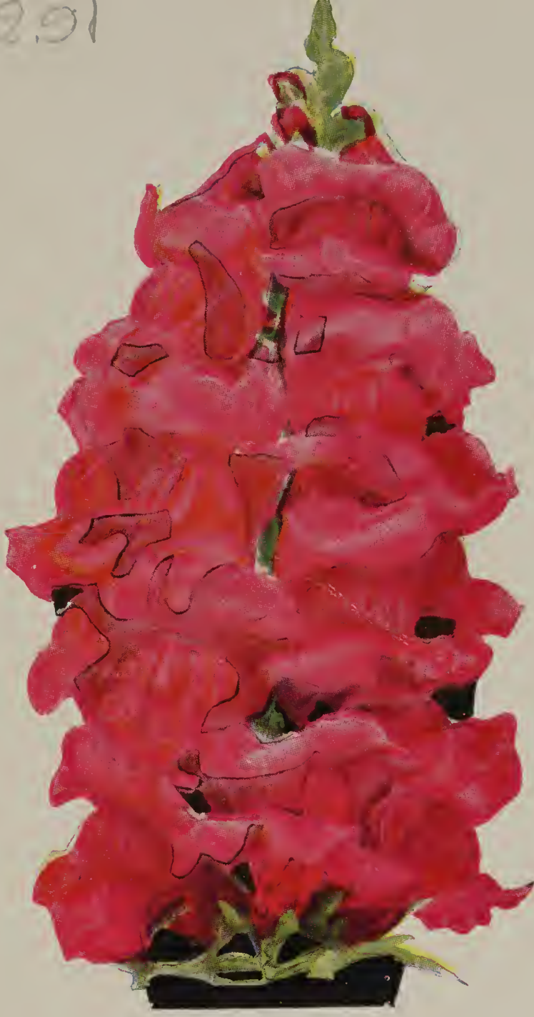
SUPER MAJESTIC SNAPDRAGONS Seed, pkt. 20c. Plants, 35c doz.

LIBRARY RECEIVED ☆ MAR 13 1939 ☆ U. S. Department of Agriculture Sec. 562, P. L. & R. U. S. POSTAGE PAID Wenatchee, Wash. Permit No. 35